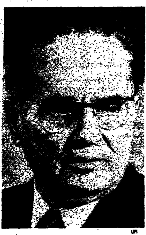
Marshal Tito in 1974